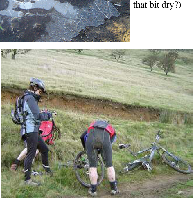
"Mistress" Sarah enlivens Richard's puncture repairs. (OK, it's really just an inner tube plus a little "Artistic Licence")

We climbed Ollerset using the road and track to the North the crossed over the top to descend to Hills House farm. Over both roads and blasted down into a lake of cold air in the wellnamed Coldwell Clough. (Although "Puncture Clough" would also have described it. Smiling grimly (?) we ground up to Kinder edge Low and the muddy traverse. (Anyone ever seen