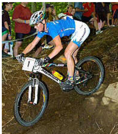
Gunn-Rita Dahle seemed happy with 2nd place